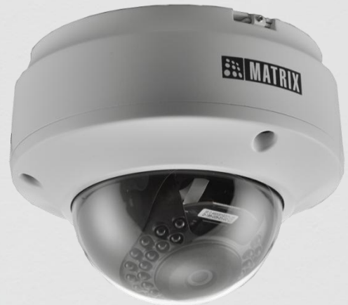
SATATYA CIDR20FL36CW-S 2MP IR Dome Camera with 3.6mm Lens

Matrix project series IP Cameras are built using superior components such as Sony STARVIS sensor and higher MTF lens to offer unmatched image quality especially during the low light conditions. Powered by True WDR algorithm, these cameras offer consistent image quality even in highly varying lighting conditions. Built in intelligent analytics including Intrusion Detection, Trip Wire, etc. ensure real-time security. Moreover, H.265 compression and Automatic Motion based Frame Rate Reduction save bandwidth and storage up to 50%.